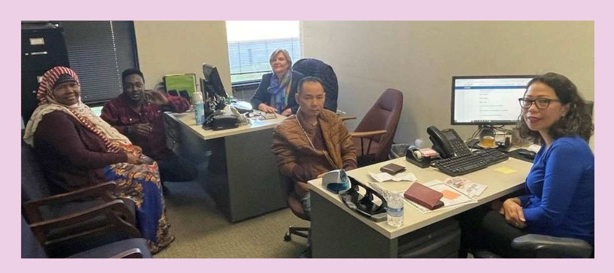
RSCC office assisting neighbors of all nations

issues like PTSD due to the wars and persecutions back in their home countries. OUR RSCC personnel help these refugees fill out the required forms and also provide emotional support. Our missionaries often serve as translators during the final test. As a result, these refugees become new American citizens. In the process many become our friends and make DOW their new refuge for many years.