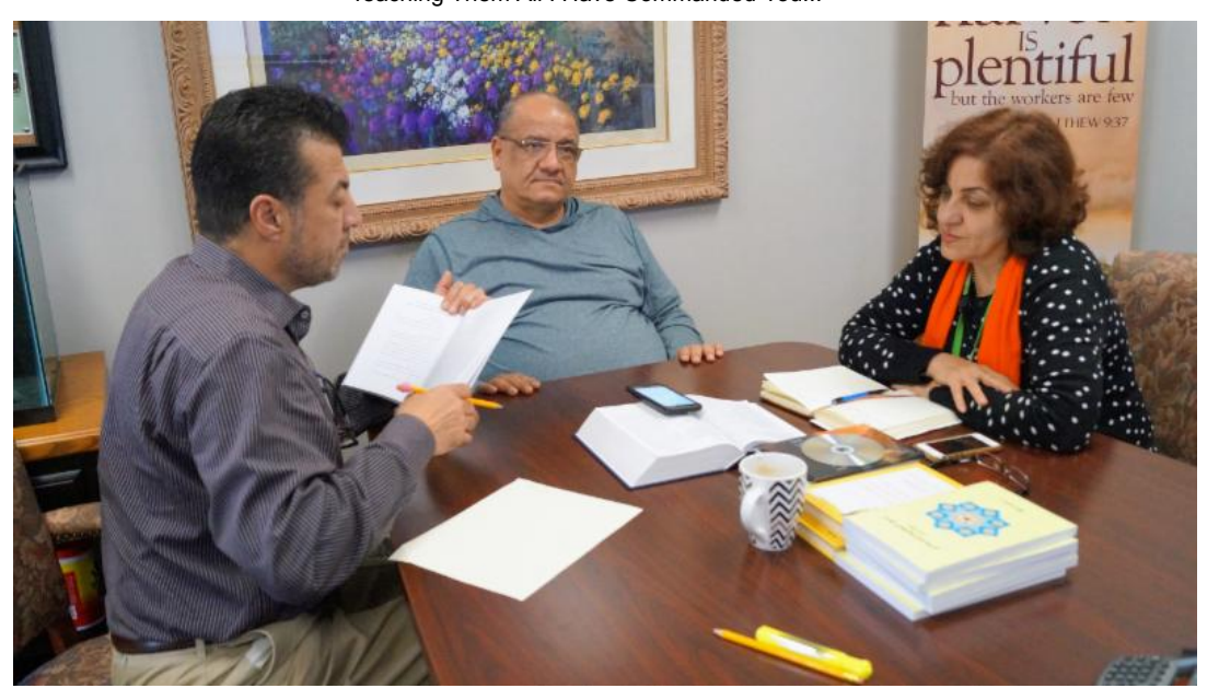
Monday Catechism Class

See what's happening on our Facebook Page: