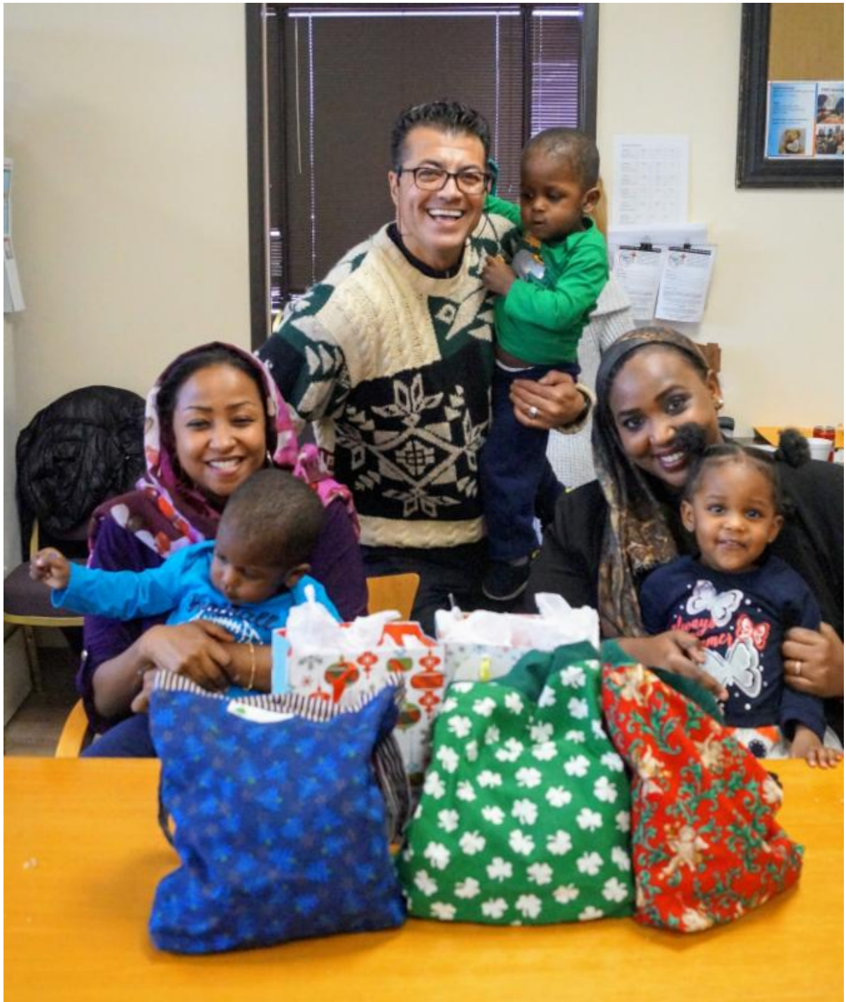
All the Children received bags made by Sewing Seeds of Faith Sewing Women.