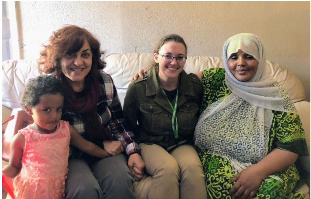
RSC Staff make home visits to refugee neighbors that have come to the RSC for help.