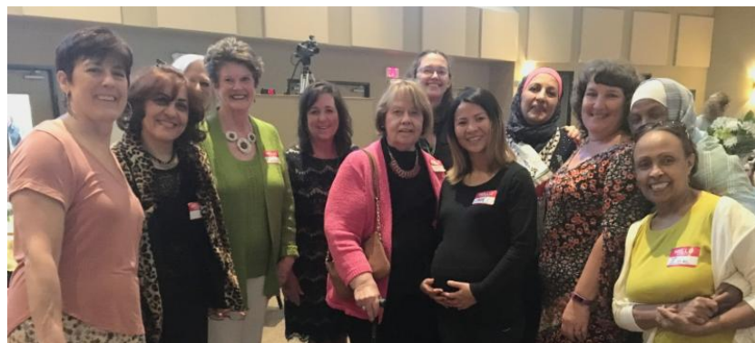
St. John Bluebonnet Luncheon Fellowship

We encourage you to Pray over these people with us for the Glory of God!