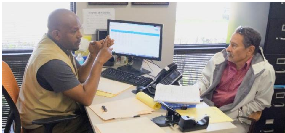
RSC Staff helps an Egyptian man with employment applications.