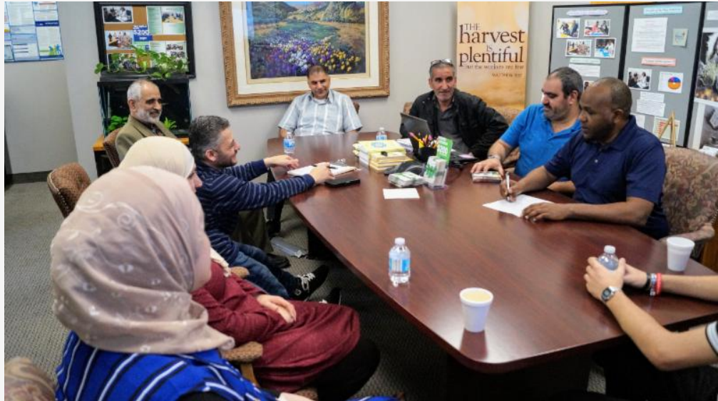
The RSC staff greet and build relationships with DOW's Refugee Neighbors while they wait for assistance.