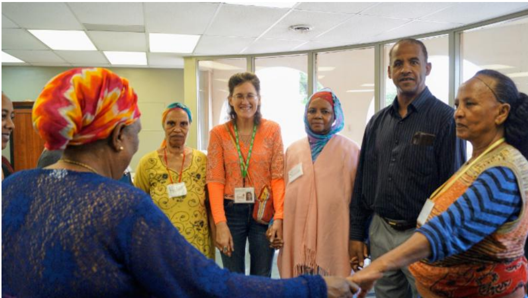
Opening Prayer Circle at Monday Sewing Seeds of Faith.