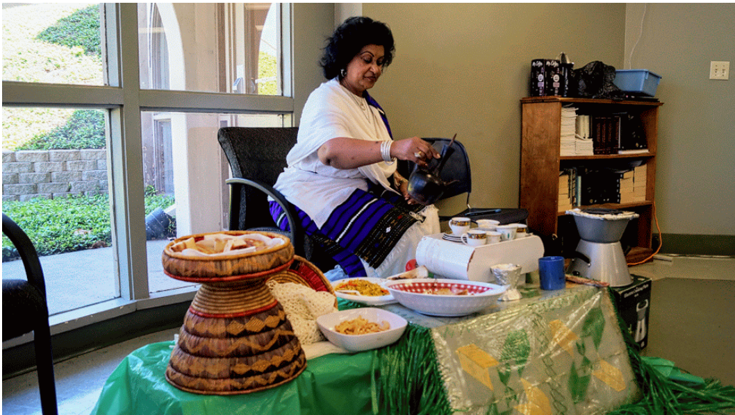
An Eritrean Coffee Ceremony