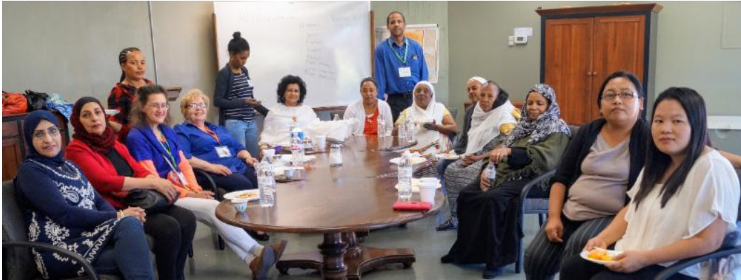
Women of the Way enjoying fellowship.

"One who is taught the word must share all good things with the one who teaches." Galatians 6:6