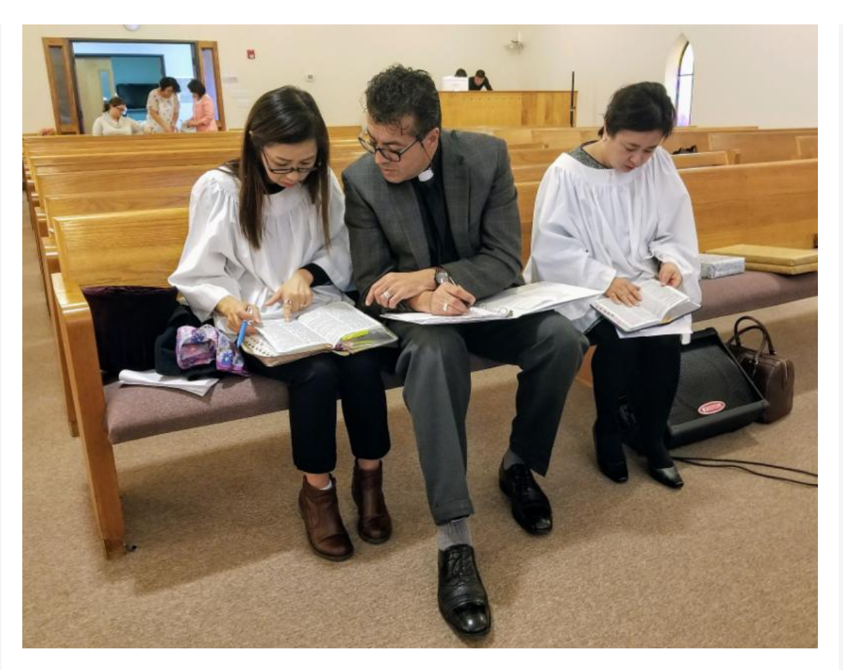
"What Does it mean?": Catechism Review before the Baptism Service.

"But when the fullness of time had come, God sent forth his Son, born of woman, born under the law, to redeem those who were under the law, so that we might receive adoption as sons. And because you are sons,