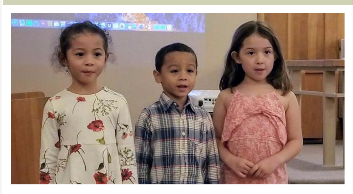
Youngest Children singing "Jesus Loves Me".

"I have no greater joy than to hear that my children are walking in the truth." - 3 John 1:4