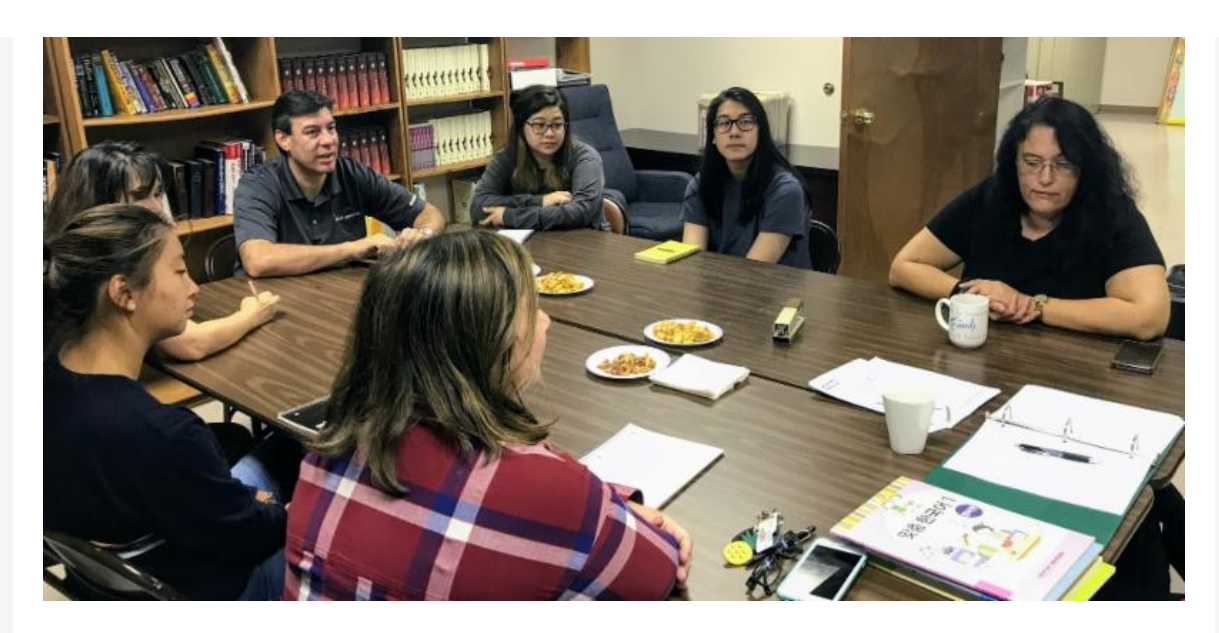
Youth Bible Study.