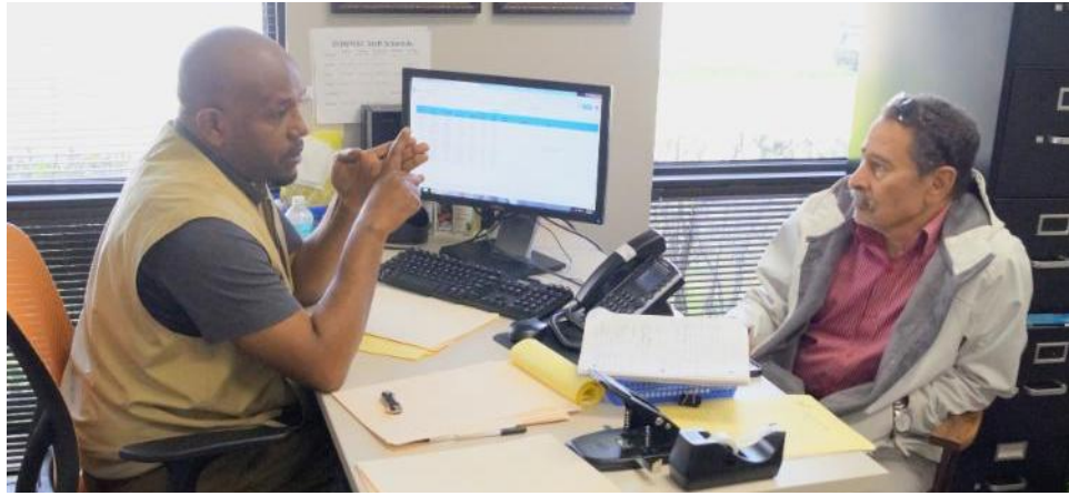
RSC Staff helps an Egyptian man with employment applications.