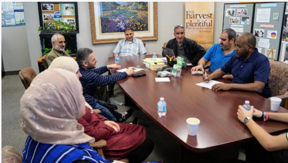
The RSC staff greet and build relationships with DOW's Refugee Neighbors while they wait for assistance.