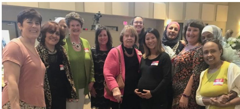
St. John Bluebonnet Luncheon Fellowship

We encourage you to Pray over these people with us for the Glory of God!